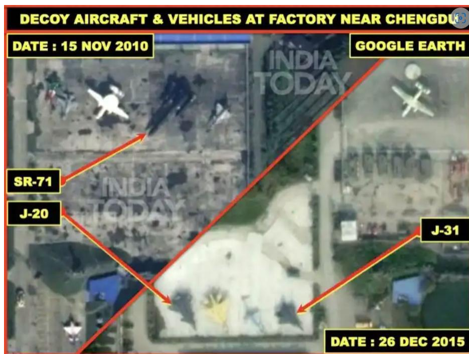
Figure 2. Employment of Decoy Aircraft and Vehicles in China (Bhat, 2020, follows para. 11)

surveillance equipment. An inflatable vehicle is an example of this kind of decoy. A second category of decoy is typically associated with aircraft and submarines. It is built to “spoof” the acquisition systems of interceptor weapons, such as missiles and torpedoes intended to divert a guided projectile from the target.