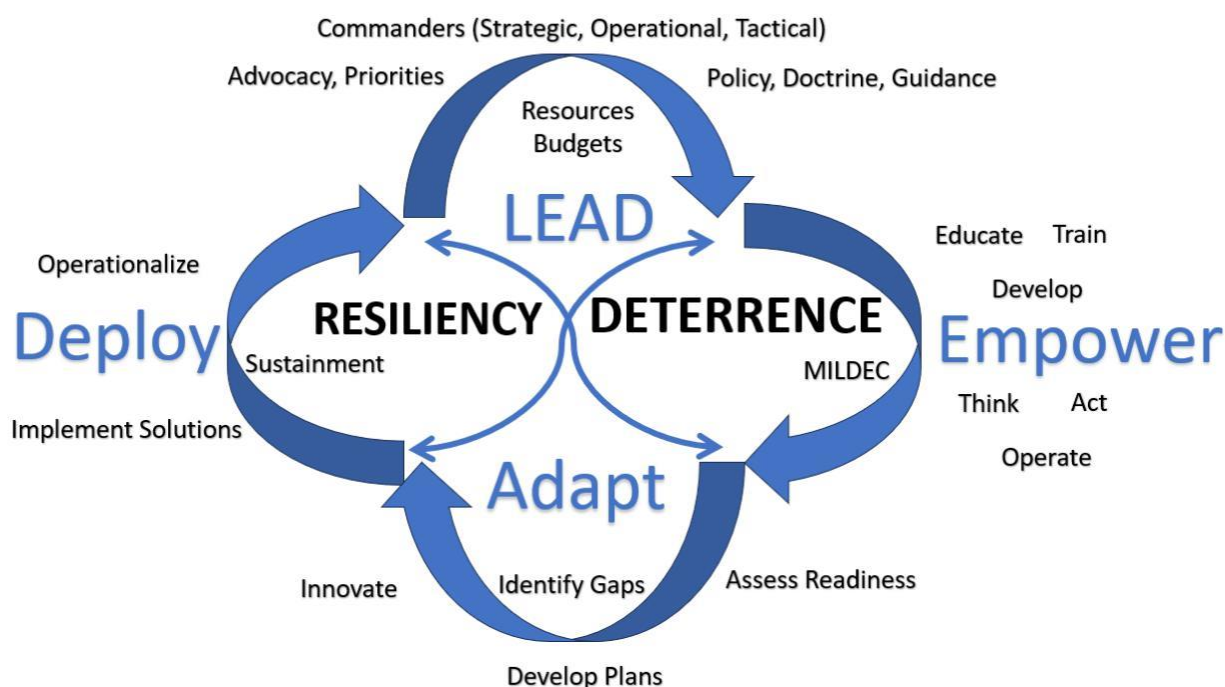
Figure 4. The LEAD Model for passive AMD – Lead, Empower, Adapt, Deploy

Becoming more effective and efficient in developing and employing passive defense begins with leadership. To make significant progress, strategic-level leaders must be committed to delivering the policies, capabilities, and resources needed. By prioritizing increased investment in passive AMD, the Department of Defense can more effectively detect, deter, deny, and defeat attacks on the homeland of the U.S. and friendly forces abroad. The LEAD Model in Figure 4 provides a valuable framework for advancing joint warfighter effectiveness in the passive AMD arena. In the model, “lead, empower, adapt and deploy” are not sequential but relate through a dynamic and interactive continuous improvement process.