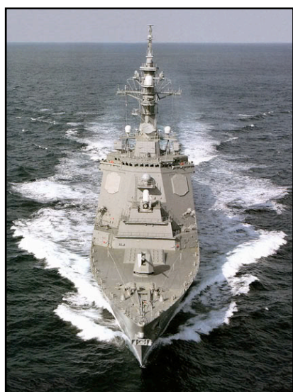
Japan's Atago Class Cruiser