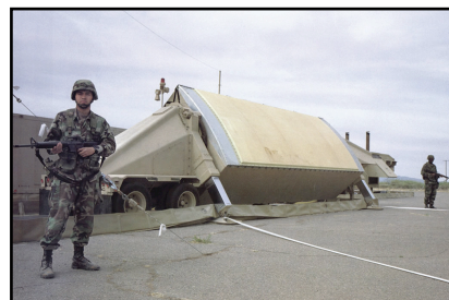
Right: U.S. TPY-2 Radar Deployed in Kyogamisaki, Japan