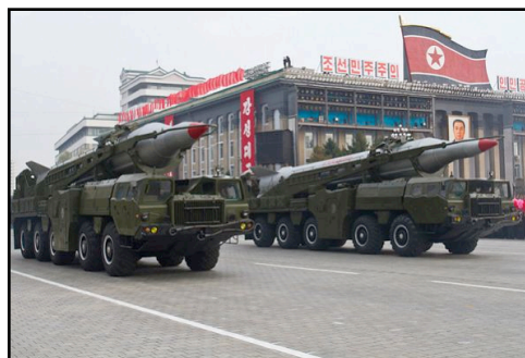
North Korean No-Dong 1 Medium Ranged Ballistic Missiles (1250 km range)

Japan also faces a secondary threat from Russia. Japan and Russia have a long-standing dispute over the Kuril island chain north of Hokkaido. Russian planes have also increasingly intruded on Japanese airspace in recent years. The Japanese Air Force has been forced to scramble fighter jets over 1000 times to intercept Russian aircraft since 2013, an issue exacerbated by Japan's realignment of its military forces to its southern islands in response to China. In addition to its large ground-launched ballistic and cruise missile arsenal, Russia has 14 submarines in its Pacific fleet armed with cruise and ballistic missiles, most of which are nuclear tipped.