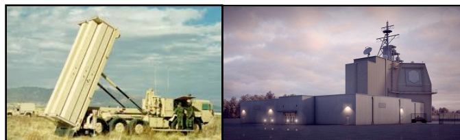
Left: Terminal High Altitude Area Defense (THAAD) Firing Unit Right: Aegis Ashore Installation

Japan is considering the JLENS aerostat surveillance and sensor capability for both tracking and fire control in its quest to defend its air space and island territory that is being constantly challenged by China and Russia.