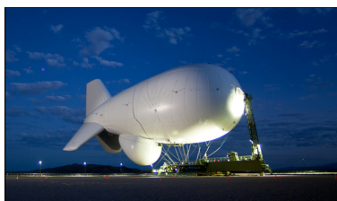
Joint Land Attack Area Netted Sensor (JLENS)