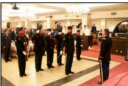
MDAA's 2013 Okinawa Missile Defender of the Year Awards